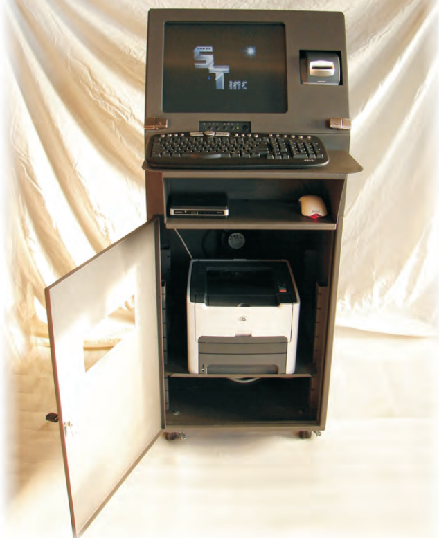
STI Kiosk Touchscreen System

For more information Contact ATM Cash Vault, LLC. (888) Scrap-Now (727-2766)