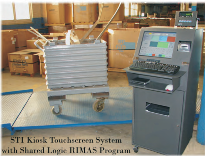
STI Kiosk Touchscreen System with Shared Logic RIMAS Program

For more information Contact ATM Cash Vault, LLC. (888) Scrap-Now (727-2766)